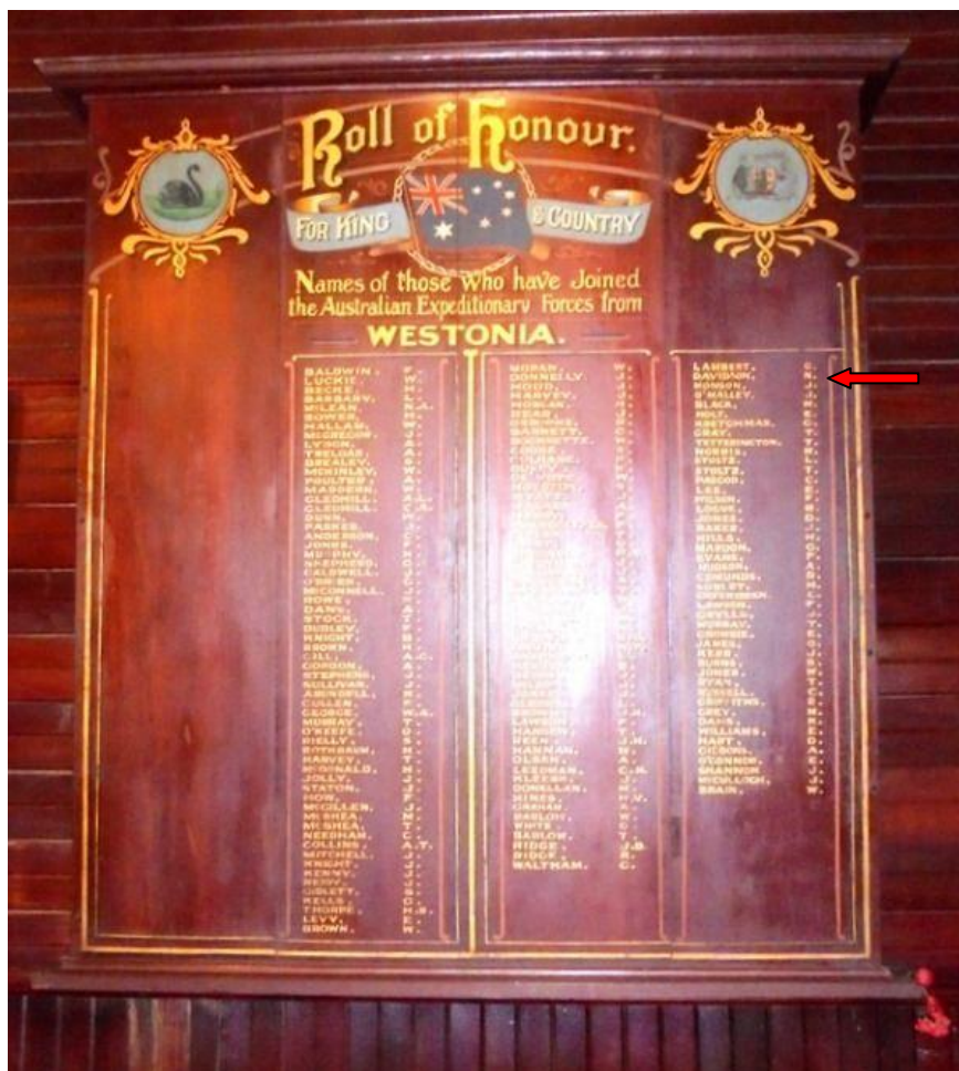
Westonia Roll of Honour