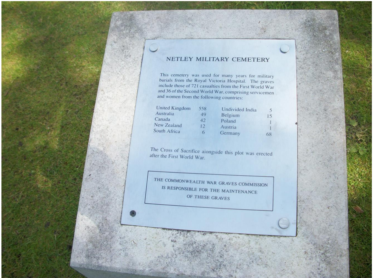
Netley Military Cemetery, Hampshire